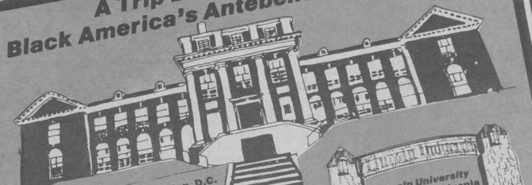
Miner Teachers College Washington, D.C.