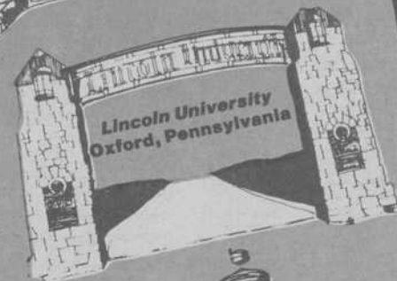
Lincoln University Oxford, Pennsylvania