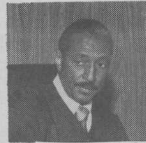
Judge Addeliar D. Guy

The National Judicial College, headquartered at the University of Nevada-Reno, trains more than 1,500 judges per year from around the world. Affiliated with the American Bar Association, NJC is the leading judicial education and training institution in the nation. Since its establishment in 1963, the College has issued more than 20,000 certificates of completion to judges of all 50 states and 92 foreign countries.