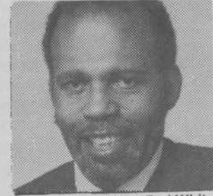
Judge Earl White