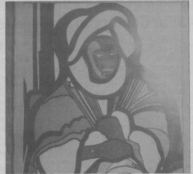
Purchased by the Las Vegas-Clark County Library District in 1986, this painting by Beni Casselle is representative of the art work on display in the 4th Annual Art Exhibit in Honor Of Black History

All the events at West Las Vegas Library, 1402 "D" Street, are free and open to the public Call 647-2117 for further information.