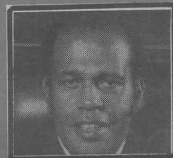
JUDGE EARLE WHITE