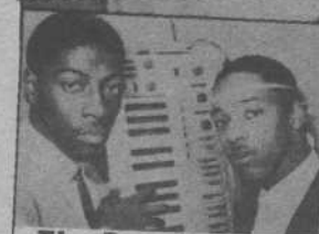
The Boogie Boys