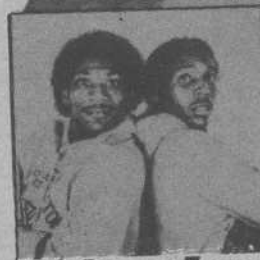
L.A. Dream Team