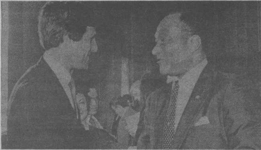
Confirmation Hearing— Sen. John Kerry, D-Mass., left speaks with Edward Perkins, nominated by President Reagan for ambassador to South Africa, after confirmation hearing before the Senate Foreign Relations Committee on Monday.