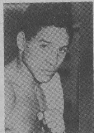
Hector "Macho" Camacho

For further information please call 702-732-5320 or 800-222-5361.