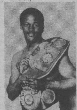
Donald "Cobra" Curry

On Saturday, September 27, undisputed world welterweight Champion Donald "Cobra" Curry (25-0, 20 KOs) takes on number one contender Lloyd Honeyghan (27-0, 17 KOs) for the 147-pound crown. The broadcast begins at 7 p.m. PDT, live from Caesars Atlanta City.