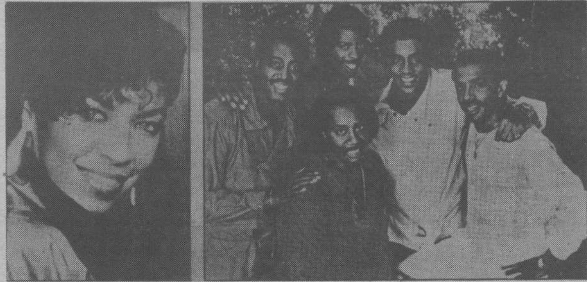
Natalie Cole and the Temptations opened Tuesday in the main showroom at the Las Vegas Hilton Hotel.

Other featured performers include: Premier bluegrass band--The Ray Park Rangers, Folk dancers--The Footloose Cloggers;