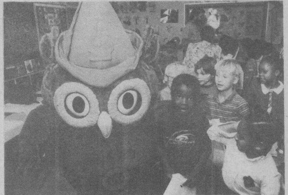
ARBOR DAY VISIT — Woodsy Owl and his helpers, the Forest Rangers, visited the Bracken Elementary School Interlanguage Core class and the first grade classes to present a lesson about trees and conservation practices. The children then planted a pine tree on the school grounds followed by a field trip to Lorenzi Park and museum where they helped clean the grounds.

330 So. 3rd St., Suite 990 Las Vegas, Nev. 89101 385-3030