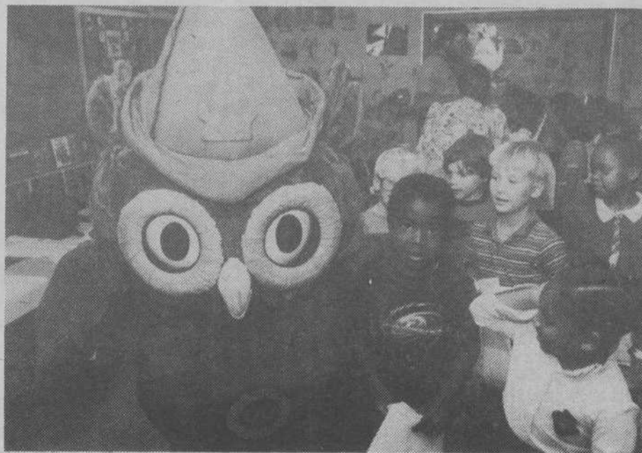
ARBOR DAY VISIT — Woodsy Owl and his helpers, the Forest Rangers, visited the Bracken Elementary School Interlanguage Core class and the first grade classes to present a lesson about trees and conservation practices. The children then planted a pine tree on the school grounds followed by a field trip to Lorenzi Park and museum where they helped clean the grounds.