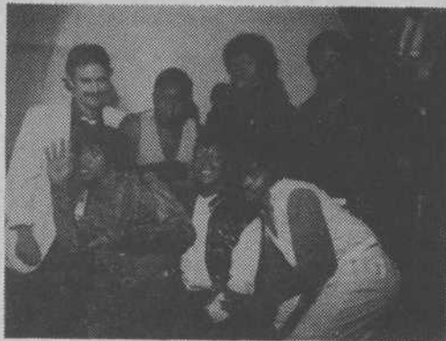
The Stereo Band