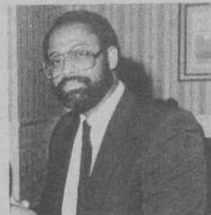
Assemblyman Morse Arberry

Three incumbent Democratic legislators filed for re-election this week with the Clark County Election Department.