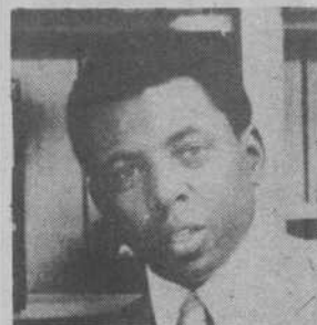
Assemblyman Gene Collins

Assemblyman Collins filed for his third term to represent Assembly District 6. In doing so he cited some of his accomplishments this past legislative session and some of the projects he hopes to continue and complete during the 1987 session.