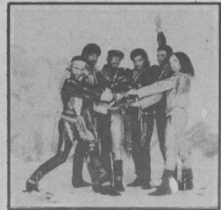
GRAND MASTER FLASH