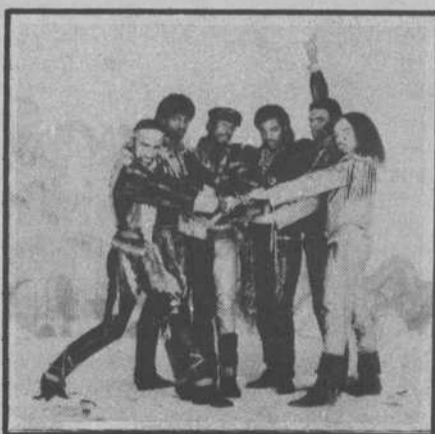
GRAND MASTER FLASH