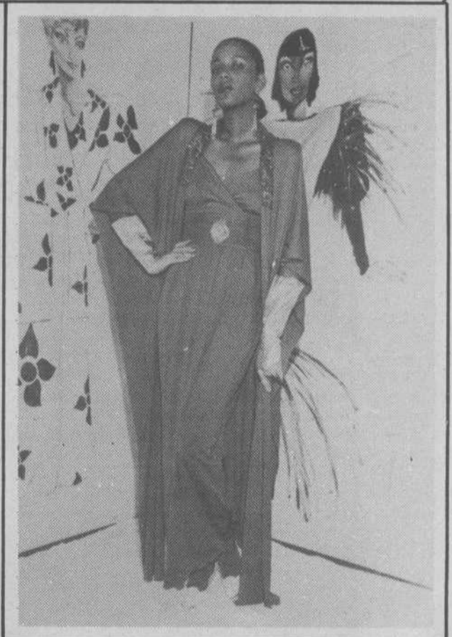
Blood Red Matte Jersey Evening Gown, draped at the waist and slim to the floor, with matching oversize Shawl Stole for those breezy evenings. By Rose Taft for Couture Fashions.