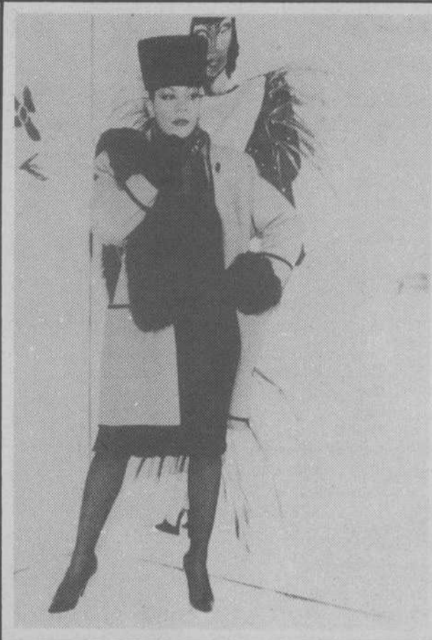
From Cuddle Coat of New York, a 7/8 length Stroller Coat in soft Meltonwood and Cashmere, in the softest shade of pink trimmed in black silk braiding. Coat features stand up collar with double oversized patched pockets, worn over Missoni's new short length sweater dress. Fox cuff gloves and Fox Boa complete this outfit.