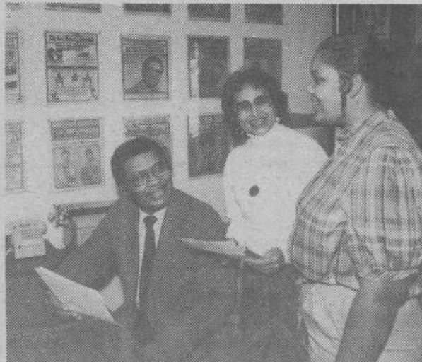
Here she is receiving her initial introduction to the newspaper field. It was an overall orientation to the operations and management of the SENTINEL-VOICE.