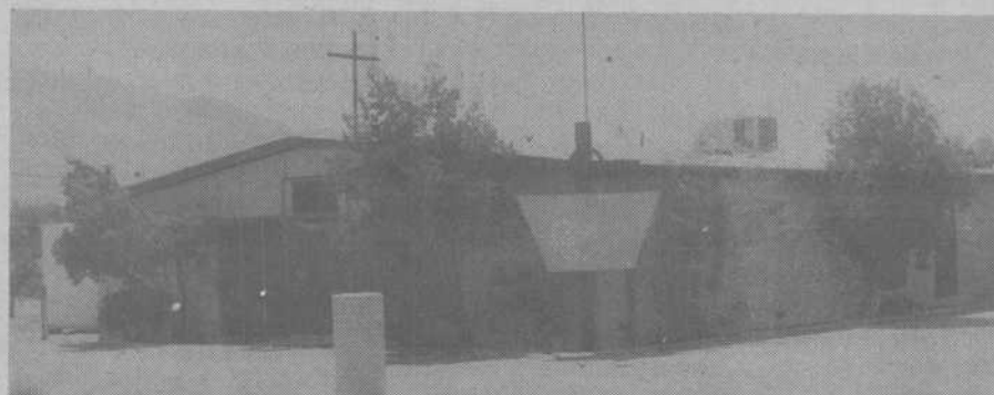
Love Center Unlimited