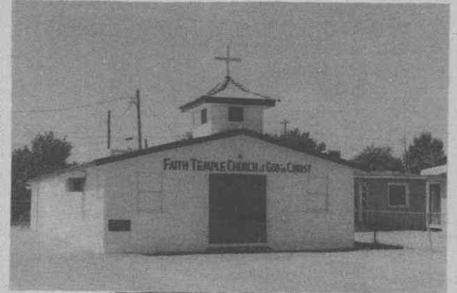
Faith Temple Church of God in Christ