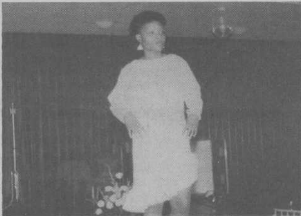
Show model on parade