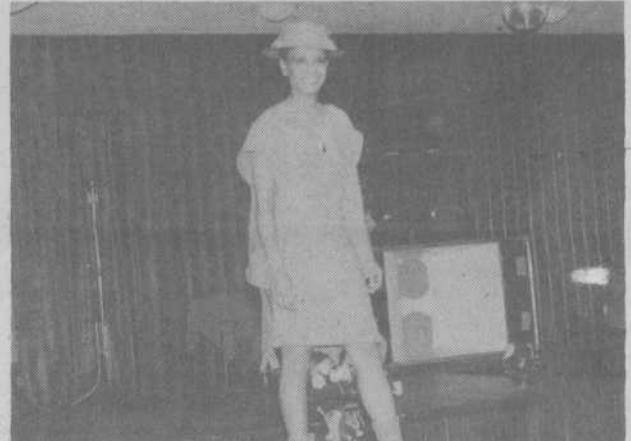
Show model on parade