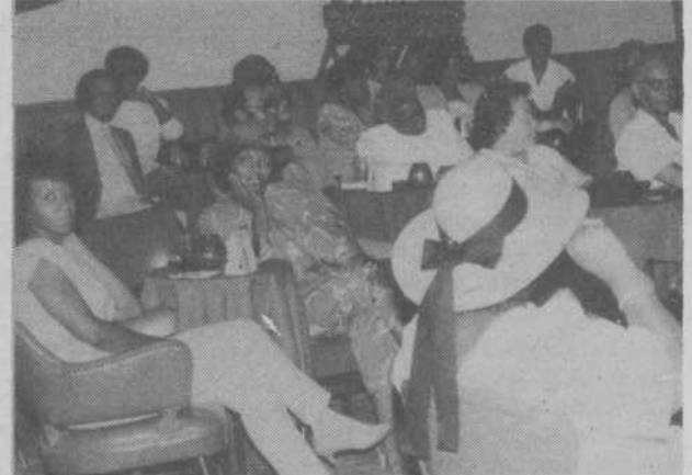
Part of the crowd on hand