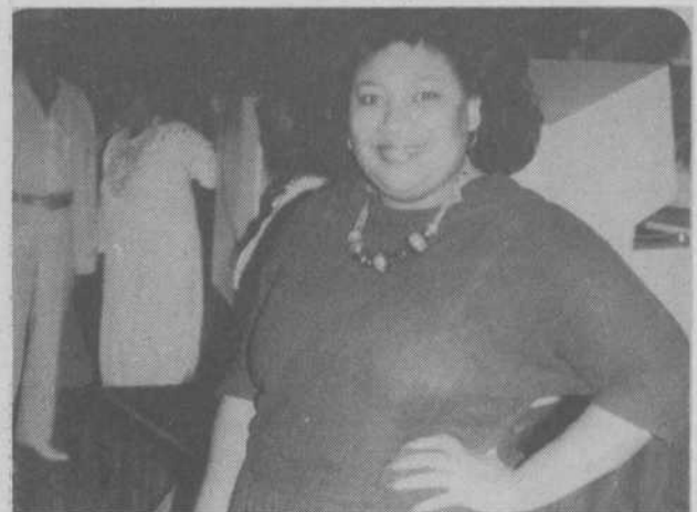
Barbara McNair