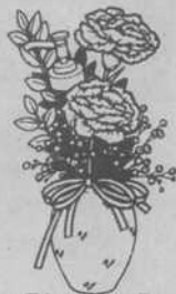
Lotion Dispenser Bouquet