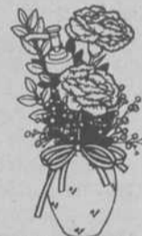
Lotion Dispenser Bouquet