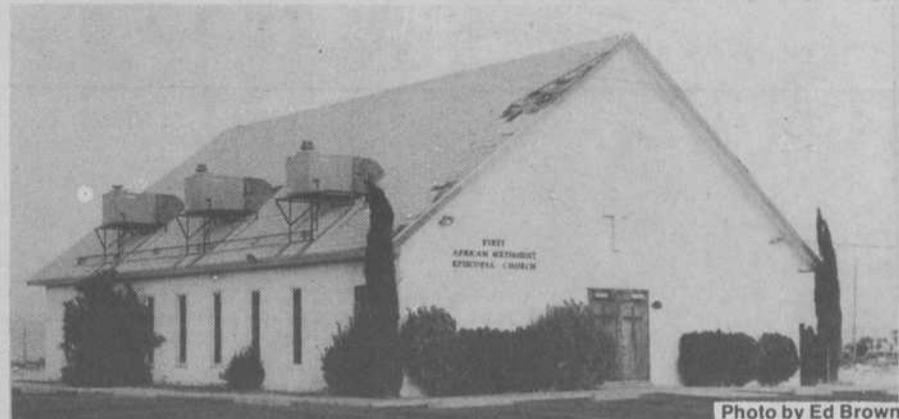
First African Methodist Episcopal Church

for if you can't reach out to the community, you have surely already failed.