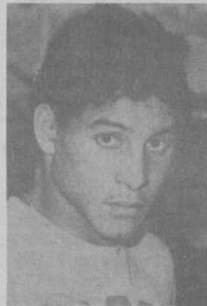
Camacho tie fight. Camacho will be going

last month's Larry Holmes-David Bey heavyweight ti-