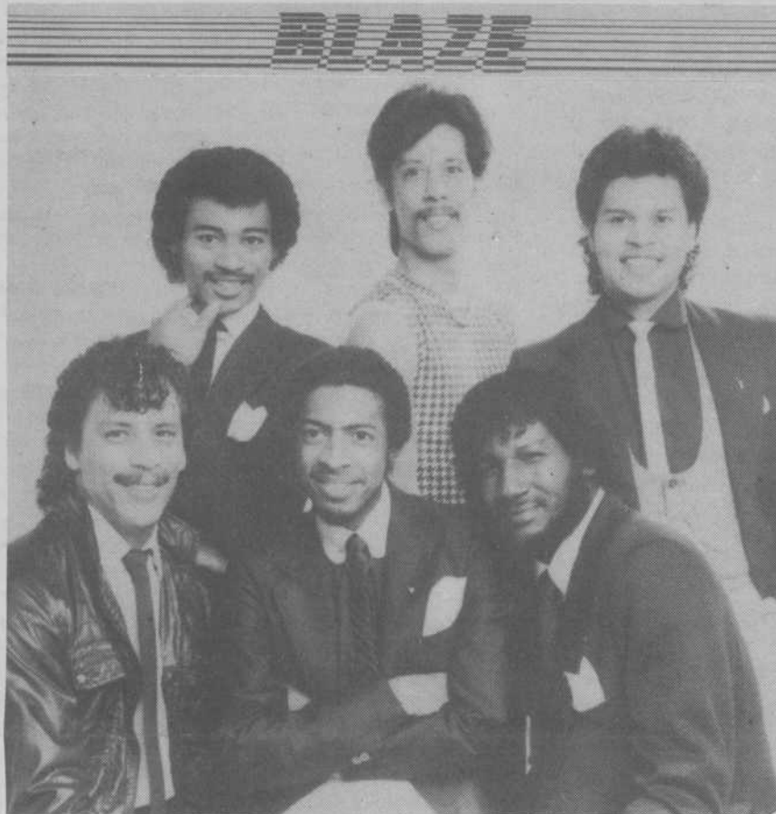
Formerly FAMILY AFFAIR

NOW APPEARING AT NEW TOWN TAVERN THIS IS THE LAST WEEK