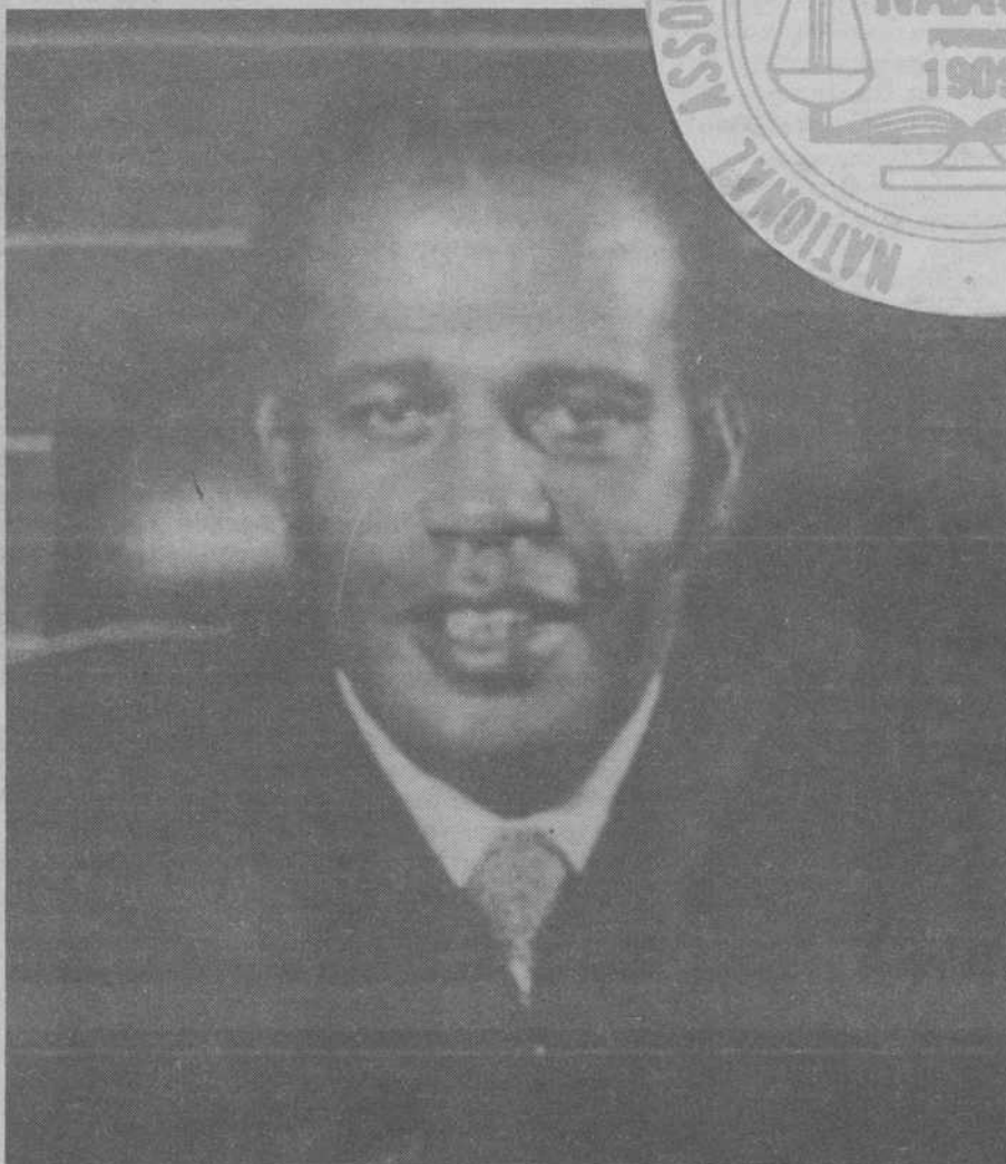
JUDGE EARLE W. WHITE, JR.

DISTRICT COURT JUDGE ADDELIAR GUY AND JUSTICE OF PEACE EARLE WHITE TO BE HONORED AT NAACP'S ANNUAL FREEDOM FUND BANQUET