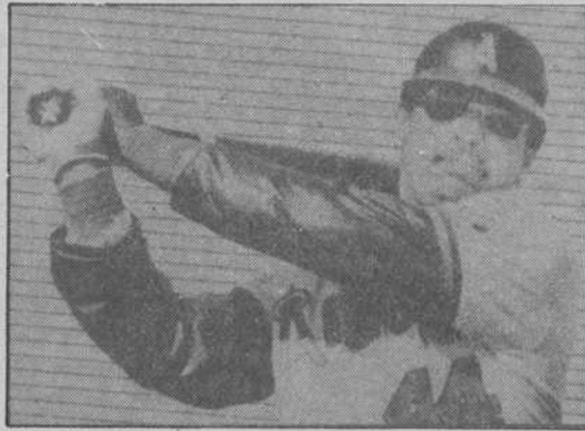
REGGIE JACKSON

After tying for the American League home run title with 39 in 1982, California Angels designated hitter/outfielder Reggie Jackson had his worst season yet in 1983 (14 HR, 49 RBI, .194 average). Here's how his 1983 home run and runs batted in figures compare to his per-season average over his 16 major-league seasons before 1983: