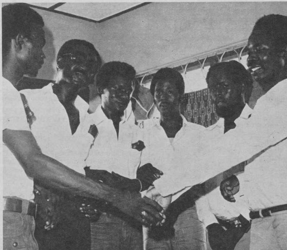
Chartering of Eta Gamma Chapter in Lagos, Nigeria.