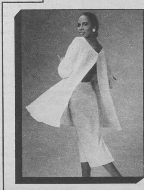
WILLI SMITH likes the play of textures in this natural linen skirt and one-button, open-back tunic in cotton casement cloth.