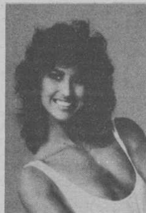
Rachel McLish female bodybuilders. Women in the Caesars Palace event will compete for $50,000 in total prize money, double the top prize awarded in past competitions. The Miss

The Caesars Palace Circus Maximus Showroom will be the site for the richest bodybuilding competition ever Dec. 10 and 11, showcasing the world's top male and