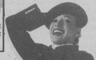
Half-black, half-Irish Jennifer Beals is Image Award nominee.

Last week the NAACP announced the nominees for the 16th Annual Image Awards. It was revealed by the Hollywood-Beverly Hills Branch of the National Association for the Advancement of Colored People that Jennifer Beals, the star of "Flashdance," is one of three nominees for the best actress category.