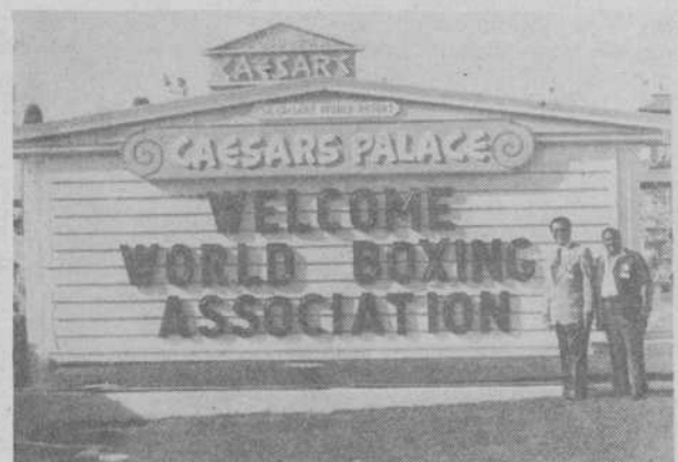
ED BROWN, Convention host, is shown with newly appointed WBA Sergeant-At-Arms York Van Nixon in front of Caesars Palace's WBA Convention Welcome Sign.