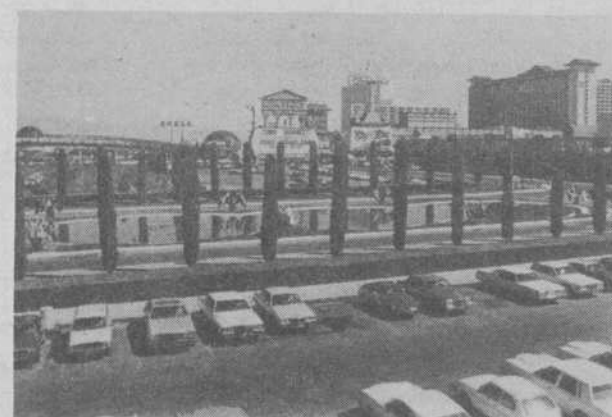
ANOTHER VIEW of the many WBA flags shown displayed around Caesars Palace fountains during the Convention.