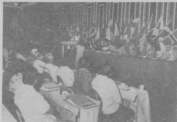
ABOVE PHOTO taken at beginning of the Convention with the welcoming address delivered by the WBA President Gilberto Mendoza. The convention was held Sept. 4-8, 1983.