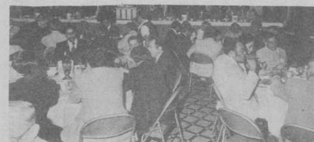
COLORFUL, ATTRACTIVE, TASTY FOOD was enjoyed by the huge number of convention members, delegates and guests at the WBA Convention served at Caesars Palace.