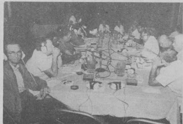
THE WBA EXECUTIVE COMMITTEE is shown in session during the WBA 62d Annual Convention held at Caesars Palace.