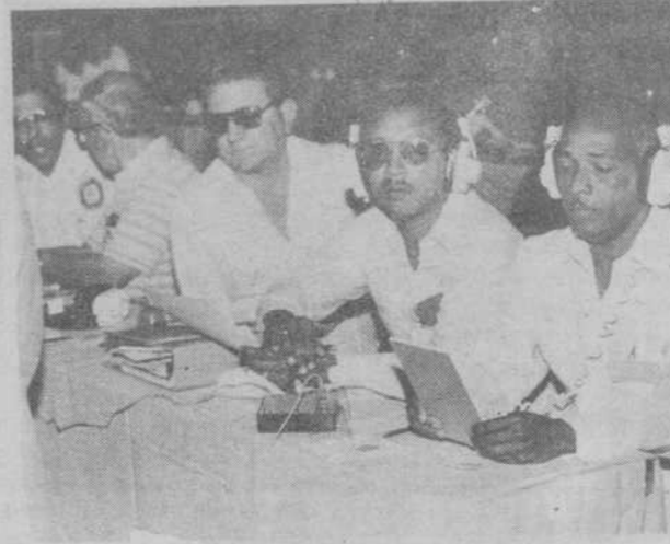
SOME OF THE DELEGATES from Panama and the Dominican Republic were also on hand for the activities of the Convention sessions.