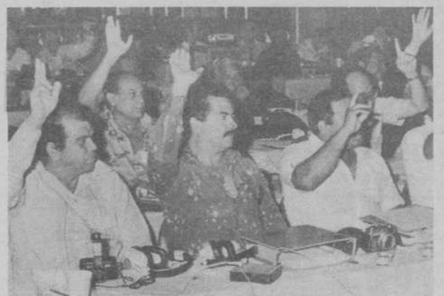
SOME OF THE DELEGATES are shown participating during one of the many sessions held during the Convention.