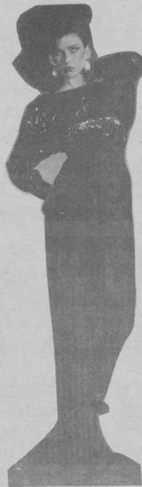
Nothing can be more elegant than tapered black velvet evening pants topped with a shiny sequined blouse with long puffed sleeves.

H oliday evenings will be dazzling this year. Gowns feature shimmering fabrics — velvet, satin — with lots of jewels, beading and sequins. Shapes can be sleek or flounced. The colors — basic black sometimes spiked with bright splashes of red, blue or gold, or bright red or green or gold to compliment the Holidays.