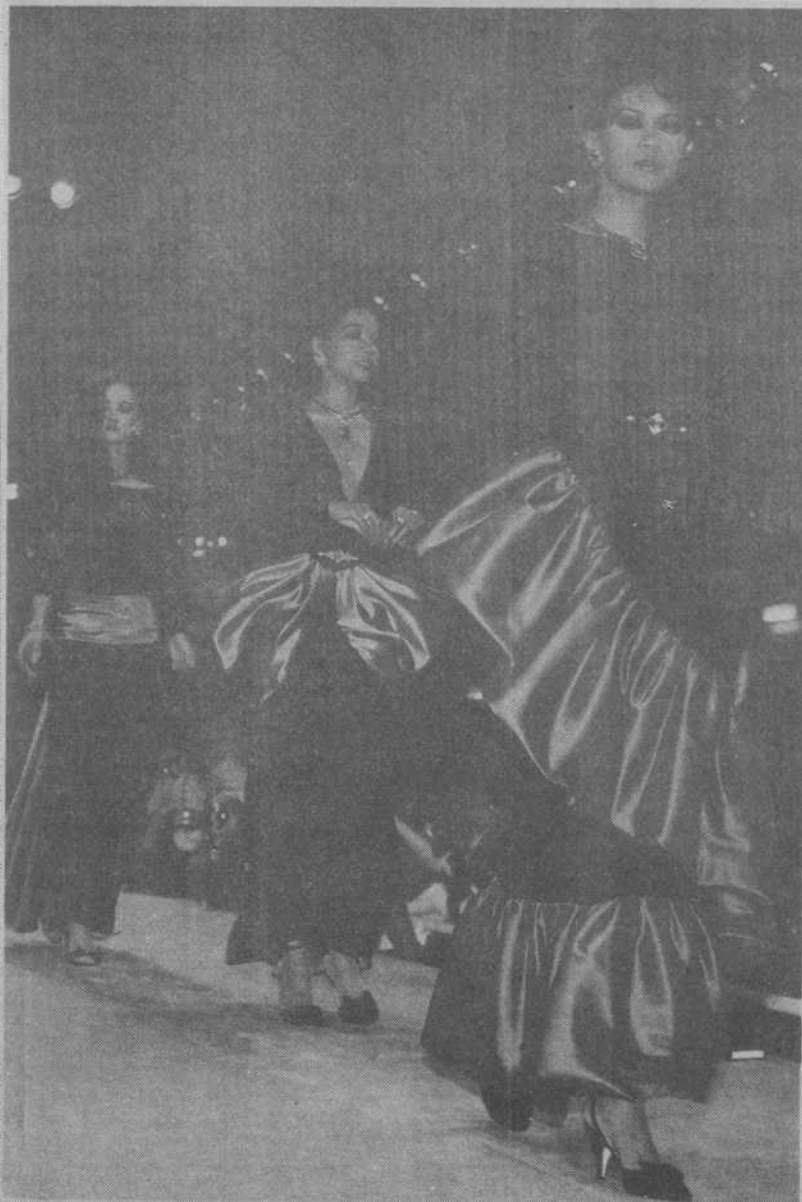
Shown here, left to right: a long black velvet sheath with wide waist to hip cummerbund and train of gold satin; a black sheath in velvet enhanced by an electric blue satin hip flounce and back skirt panel; and again the black velvet sheath, this time embellished with deep bright red satin ruffles cascading around the slim skirt.