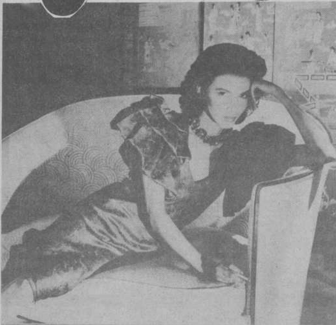
This gold and brown matte velvet print dress in the short length, is enhanced by huge flounced sleeves on either side of the plunging neckline.

H oliday evenings will be dazzling this year. Gowns feature shimmering fabrics — velvet, satin — with lots of jewels, beading and sequins. Shapes can be sleek or flounced. The colors — basic black sometimes spiked with bright splashes of red, blue or gold, or bright red or green or gold to compliment the Holidays.