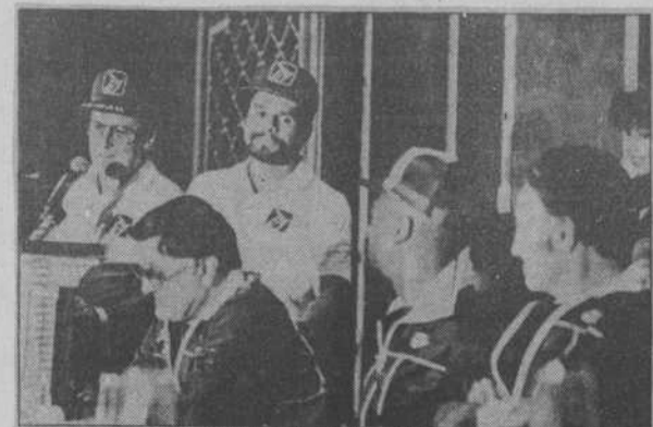
DURAN GESTURES - Roberto Duran, left, shakes his fist at world middleweight champion Marvin Haurer, right, Tuesday morning at a press conference at Caesars Palace. Duran and Hagler meet in scheduled 15-round bout Thursday night in a 15,200-seat outdoor stadium at Caesars Palace.