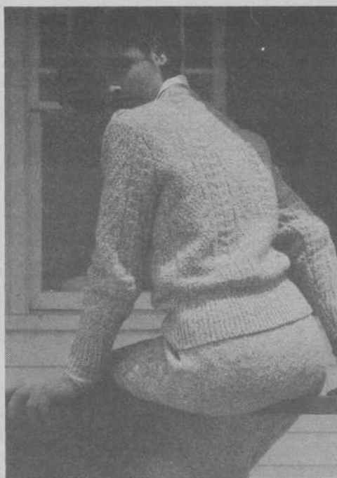
A more casual, yet still appropriate look for work comes in this rugged country white "rag" sweater, which takes on a new feminine charm when paired with a longer matching knitted skirt. Accessorize it with a crisp white shirt and lower-heeled shoes.