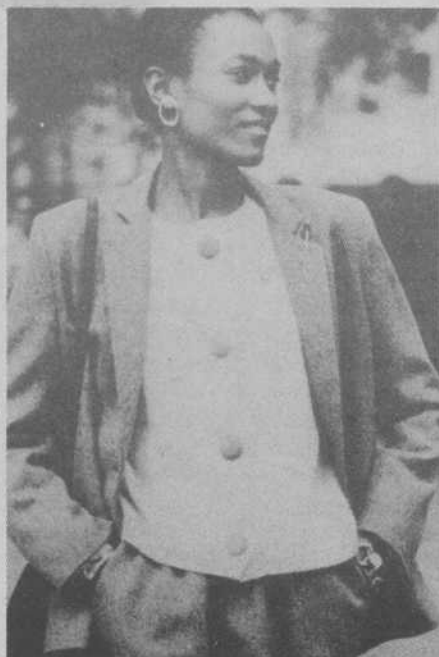
Another day, switch the top to the relaxed look of a sweater, with newsmaking oversized suede buttons.

Pair the jacket from your suit with a different slim skirt, which, while looking conservative and professional, still lends pattern and texture interest. Soften this menswear outfit with a pale silk shirt finished with a classic pin, classic pumps and your classic attache case.