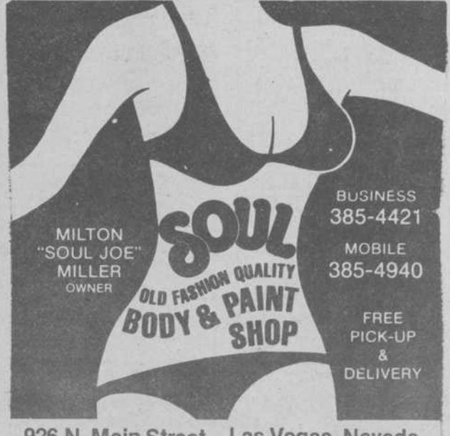
926 N. Main Street Las Vegas, Nevada