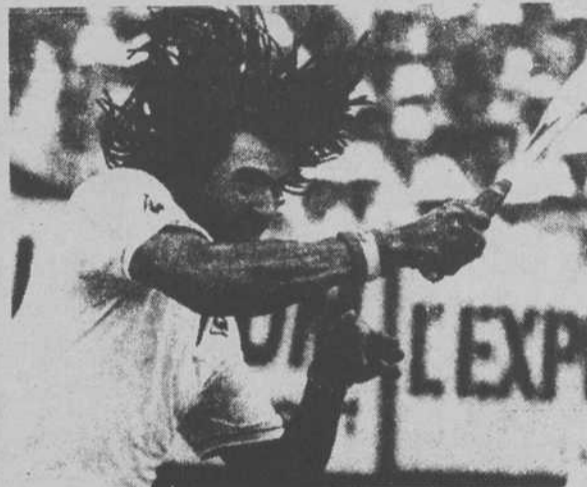
Yannick Noah...defeats Mats Wilander for title

Mats Wilander, the defending champion, by the score of 6-2, 7-5, 7-6, and had become the first Frenchman to win the French Open title since 1946. It was the biggest day of Noah's life and