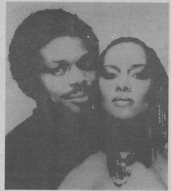
Peaches & Herb