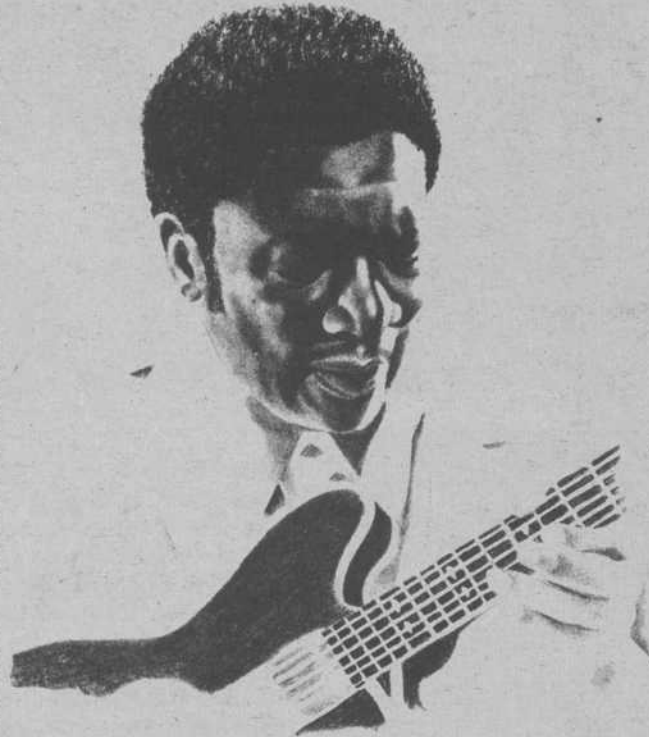
King's Las Vegas offices in the Atrium. All seats are reserved. Tickets are $10 and $15.

Tickets for B.B. King's first Las Vegas engagement in nearly five years are on sale at the Sahara (1 a.m. - 11 p.m. daily), the Allied Arts Council and at