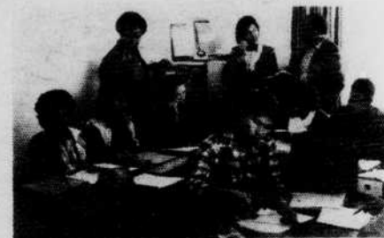
Job training and opportunities for careers increase for all Namibians.