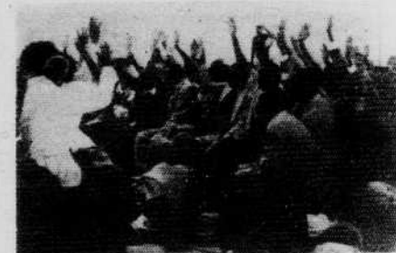
Thousands of people in Owamboland turned out to attend the DTA's political meetings that were held in the northern region of Namibia.

Seventh, it is often said that most of the civil servants in the country are whites and that there are no openings for blacks in this service. It is true that the majority of such positions at this time are held by whites, but it should also be noted that the government established in 1979 a training institute for civil servants for the sole purpose of preparing competent, young, black students as civil servants.