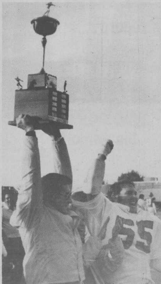
He gets involved . . .