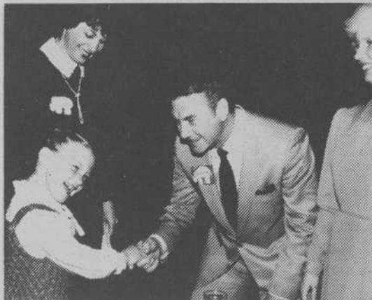
He has the warmth and compassion needed for listening to everyone's problems.