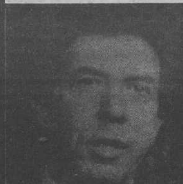
STAN COLTON Governor