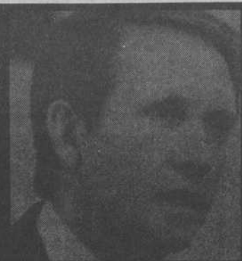
HARRY REID U.S. Representative