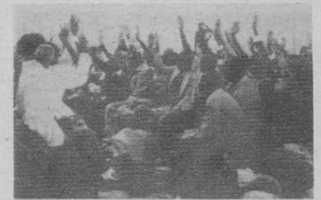
Thousands of people in Owamboland turned out to attend the DTA's political meetings that were held in the northern region of Namibia.

Seventh, it is often said that most of the civil servants in the country are whites and that there are no openings for blacks in this service. It is true that the majority of such positions at this time are held by whites, but it should also be noted that the government established in 1979 a training institute for civil servants for the sole purpose of preparing competent, young, black students as civil servants.