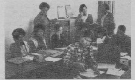
Job training and opportunities for careers increase for all Namibians.