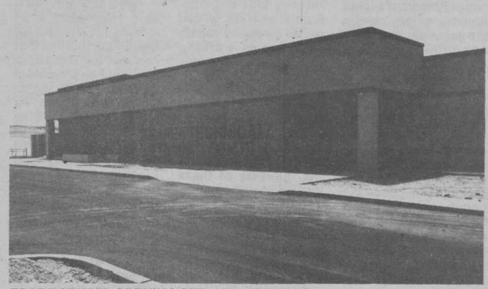
TRADE CENTER OPENING SET-Containing 50,000 square feet of space, the new Area Technical Trade Center (ATTC) is one of three new schools opening