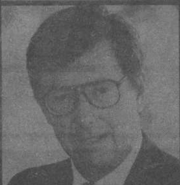
ROBERT LIST Governor