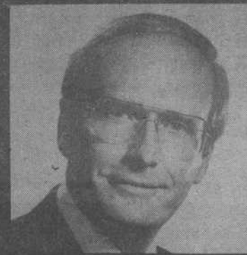
RICHARD BRYAN Governor