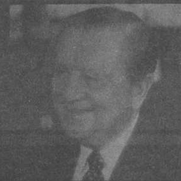
HOWARD CANNON U.S. Senator