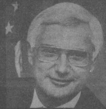
JAMES SANTINI U.S. Senator