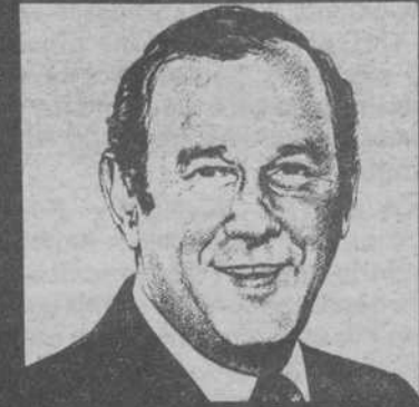
BOB CASHELL Lt. Governor