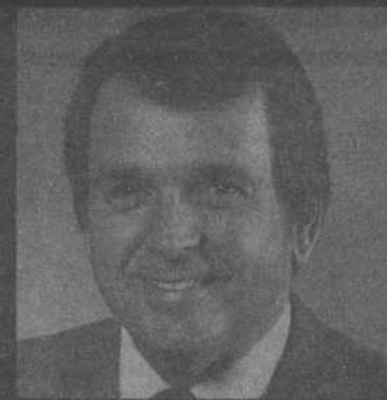
JAMES LYMAN U.S. Congress