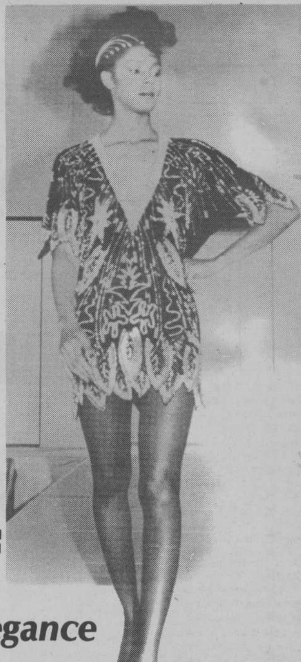
This dazzling bugle beaded mini boasts a plunging V Neckline and V scalloped hemline and sleeves. In black with silver or gold beads.