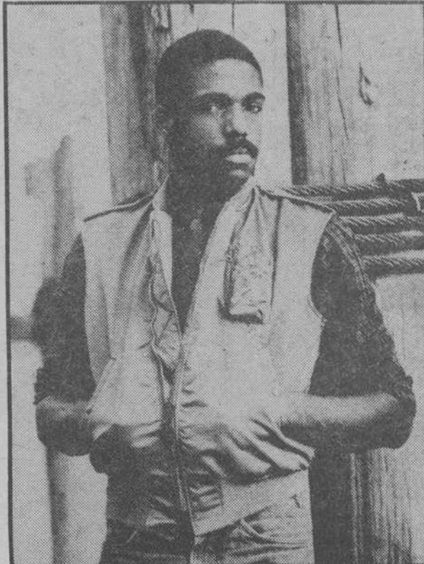
A nylon flight jacket bids farewell to arms, resulting in an ideal transitional vest.