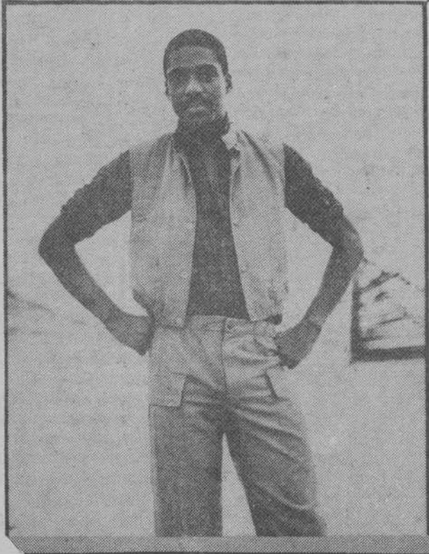
Cotton canvas is the medium, smooth quilted shoulders and back is the message.