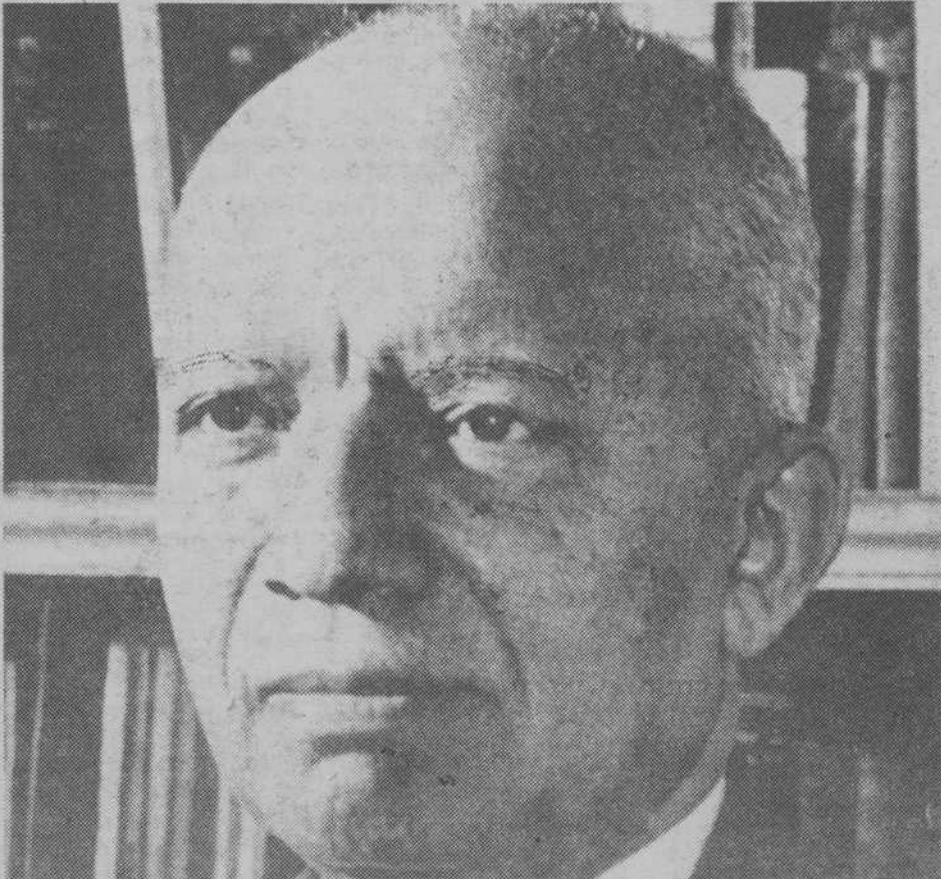
CARTER GOODWIN WOODSON (b. New Canton, Virginia, December 19, 1875; d. April 3, 1950), distinguished Negro history specialist. Author of 16 books about the Negro, initiated the annual February observation of Negro History Week, founder of the Association for the Study of Negro Life and History and founder and editor of the Journal of Negro History and The Negro History Bulletin.