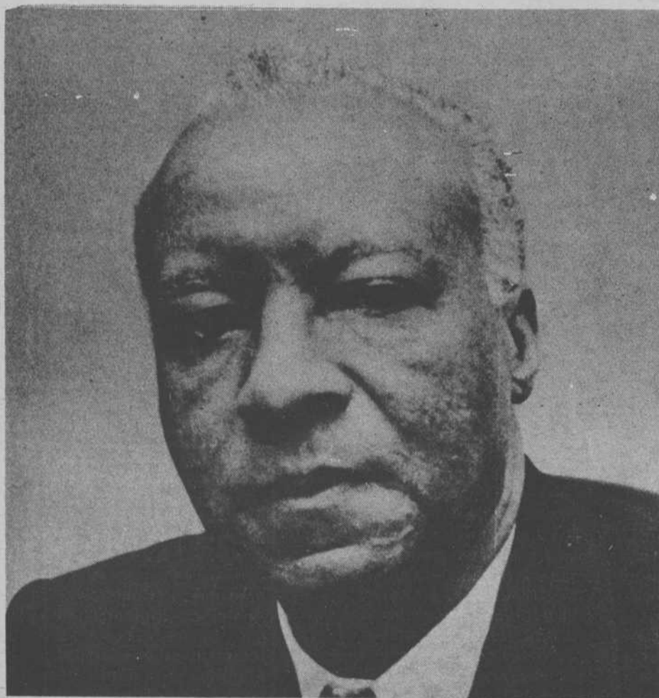
ASA PHILIP RANDOLPH — born Crescent City, Florida, April 15, 1889; labor leader, organizer of the Brotherhood of Sleeping Car Porters, vice president of AFL-CIO and member of the executive council; organizer of the March on Washington 1941 which led to Committee on Fair Employment Practices.