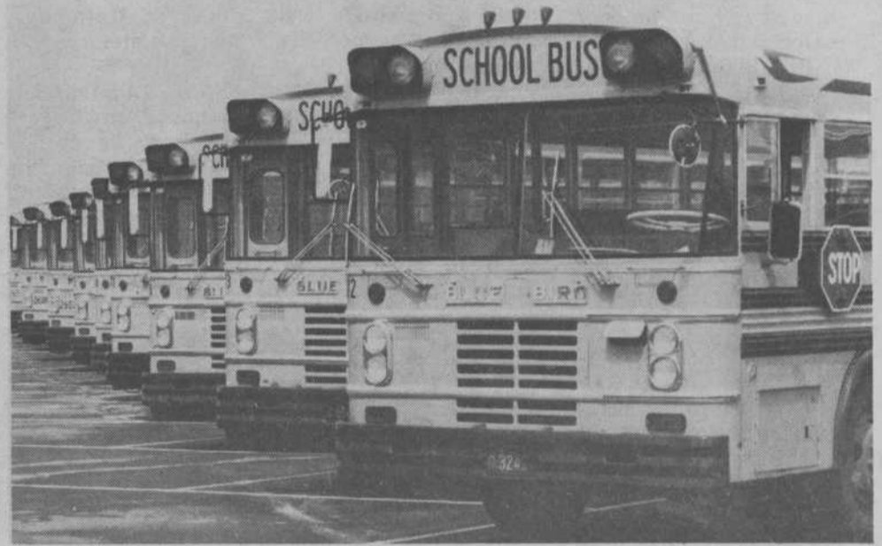
SCHOOL BUSES READY — Over 300 school buses are available to transport, to and from school, any student living more than two miles from their assigned classroom. The fleet includes vehicles modified to accommodate special education students. Buses are housed at yards in two locations: Eastern and Stewart, and on Arville off West Tropicana.