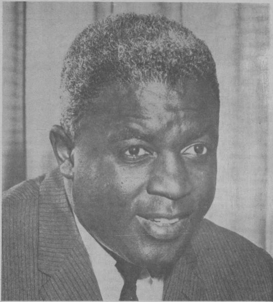
Jackie Robinson, born in Cairo, Georgia, January 31, 1919; first Negro to play in major league baseball, 1947; Most Valuable Player Award, 1949; former vice president, Chock Full O'Nuts; co-chairman, Freedom National Bank in Harlem; baseball commentator on ABC-TV; columnist in national press.