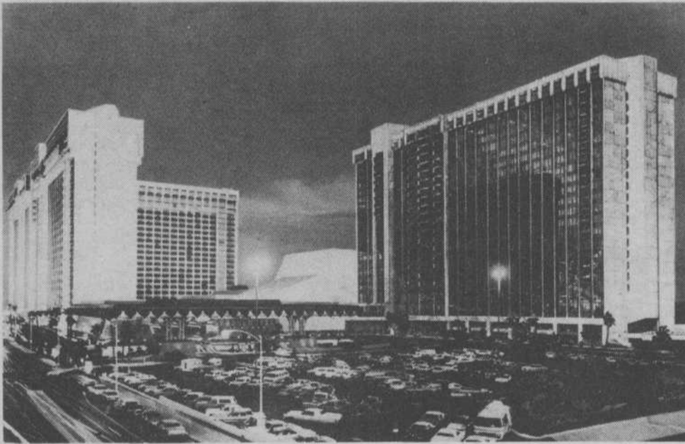
MGM GRAND HOTEL will reopen on July 30 and at that time will be the world's largest with over 3,000 rooms. It will also have one of the most modern and elaborate fire and safety control systems anywhere. There will be some 5,200 employees some of whom will be added upon completion of the new section shown on the right.

A new policy of benign neglect is an invitation to further erosion of our cities, greater racial tensions in our society, and, ultimately, damage to our nation's ability to restore the economy and America's place in the world.