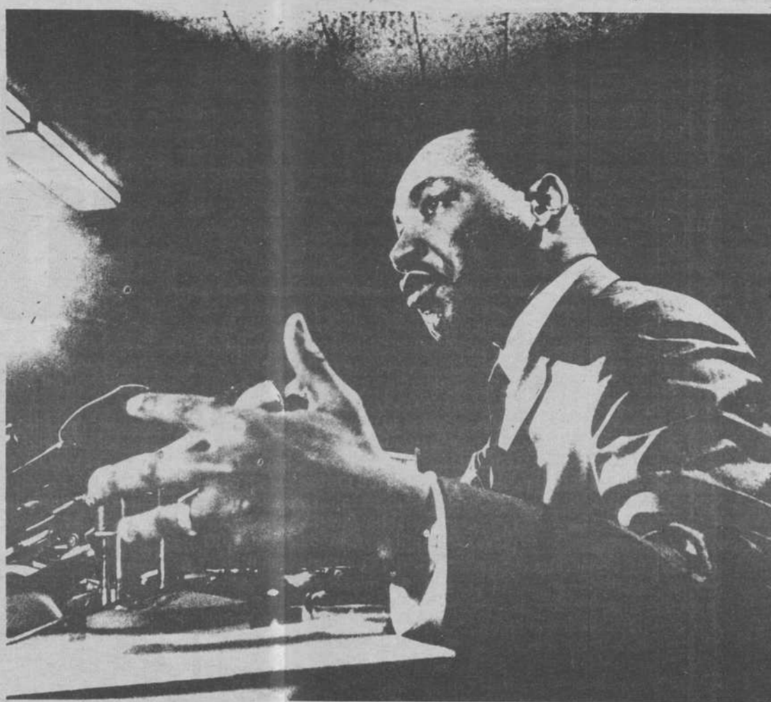
Dr. Martin Luther King, Jr.

As those events were taking place, Martin was enrolling in Crozer Theological Seminary and living in an integrated environment for the first time in his life. While studying the basic tenets of Christianity and other religions and philosophies, he was confronted with the hypocrisies of his world. In Atlanta, Blacks